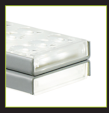
Direct & Indirect Light