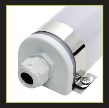
Stainless Steel Clamp

Emergency available from size 4 upwards, HE only. Through wired and plug & go add 30mm to the length.