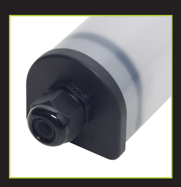
Black End Cap