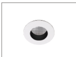
/54 IP54 ribbed glass