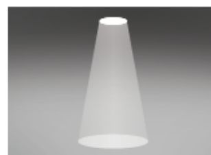
/NB 20° beam reflector