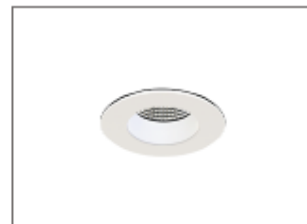
/WSB White baffle