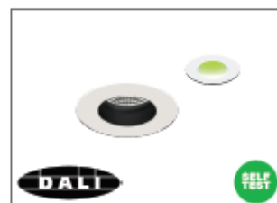
/EMD 3 hour DALI and self-test EM conversion