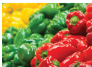
/9 Ra90 High colour rendering