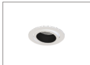
/T White tilt body