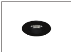
/BL Black body