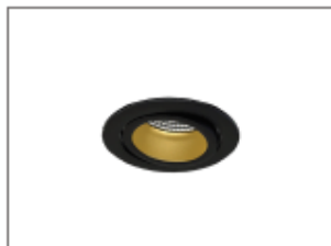
/BLT Black tilt body