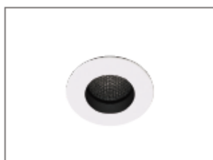
/HC Honeycomb louvre