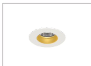
/GB Gold baffle