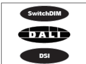
/ECO SwitchDIM + DALI + DSI