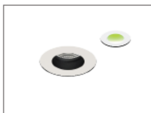
/EM 3 hour EM conversion