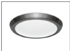
DB002 Brushed aluminium effect trim