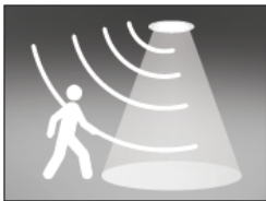
/SO Sensor on / off