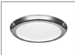
DB003 Chrome trim