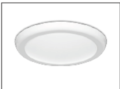
DB001 Gloss white trim