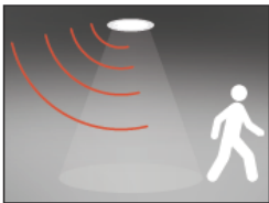
/SD Sensor dim (10 / 100%) Not available with /ECO