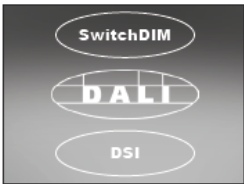
/ECO SwitchDIM, DALI or DSI