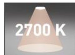
2700 K colour temperature Available with R a 90 option only