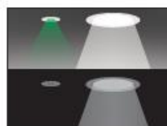
/EM EM conversion