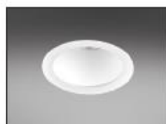
/WSB White softlight baffle