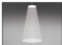
/NB Narrow beam reflector