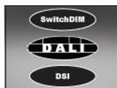
/ECO SwitchDIM, DALI or DSI