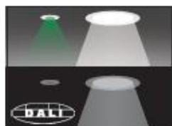
/EMD DALI EM conversion