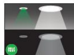
/EMS Self-test EM conversion