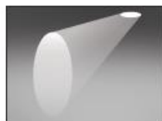
Wall wash available Please see ACA datasheet