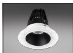
/PI Plaster-in bezel version (cut-out ø81 mm)