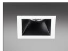
Square available Please see ACB and ACC datasheets