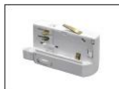
/3C 3 circuit track adaptor