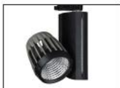
/BL Black with grey heatsink