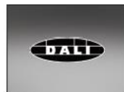
/DALI DALI control gear & track adaptor