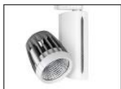
/WH White with grey heatsink