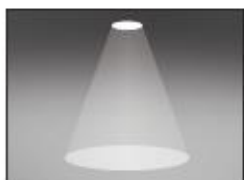
/MB 38° Medium beam reflector