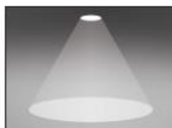
/WB 60° Wide beam reflector