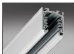
TRACK OPTIONS See our ONETRACK® datasheet