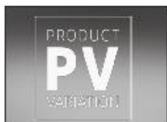
PRODUCT VARIATIONS Other colours and specifications available on request