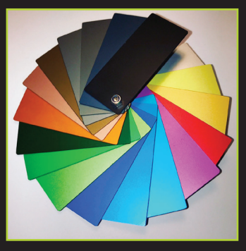
Available End Cap colours