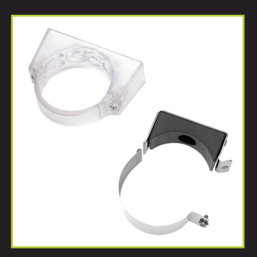
Plastic & Stainless Steel Clamps