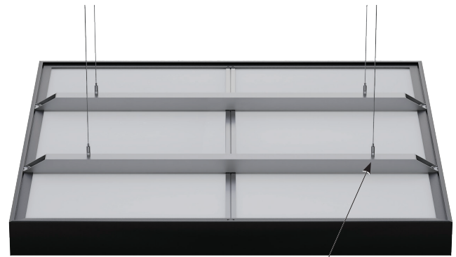
Suspended Mounting Option (LACC-SP-K)

*Surface Mount will have an opening of 1.3" (33mm) between the frame and the ceiling