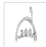
A3962.SUS - Clips Inox