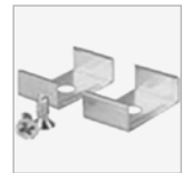
A3960.CLI Clips Inox