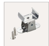
A3960.CLR Clips Rotatif