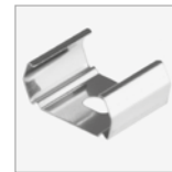
A3960.CLS Clips Inox Strong