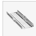
A3960.CLI Clips liaison