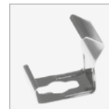
A3960.C45 Clips 45°