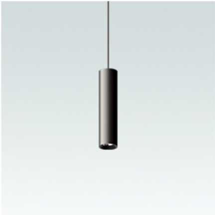
Pixo 77 - L: 330 mm