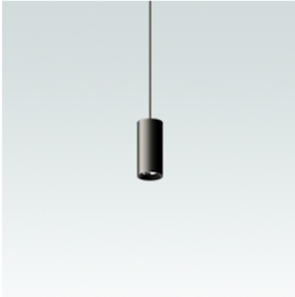
Pixo 77 - L: 170 mm