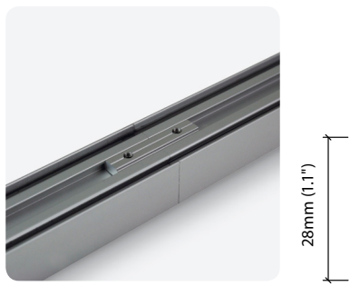
KKJT-02 Joining Bar* (Allow 1 per join) Anodised aluminium finish * Mounting option required with Joining Bar

Anodised aluminium finish * Cut & drilled to fit on site