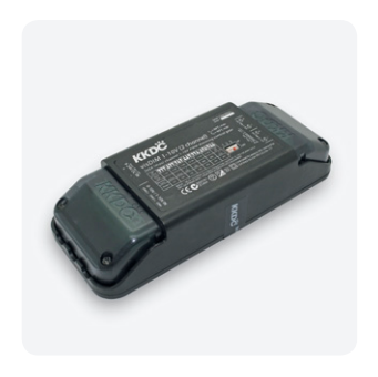
IP20 Black plastic housing L164/W64/H34mm (L6.46/W2.52/H1.34in)