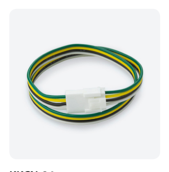
KKCN-24 4 PIN LEDmix 300mm (11.81") extension lead