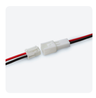
KKCN-01 50mm (1.97") pair KKCN-03 300mm (11.81") pair 2 PIN male + female connector set