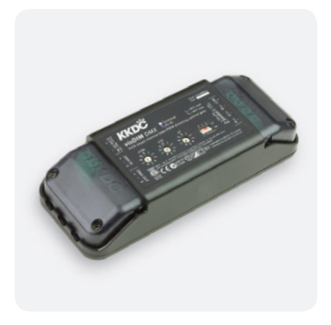
IP20 Black plastic housing L164/W64/H34mm (L6.46/W2.52/H1.34in)