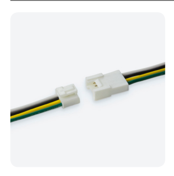
KKCN-18 50mm (1.97") pair KKCN-19 300mm (11.81") pair 4 PIN LEDmix male + female connector set