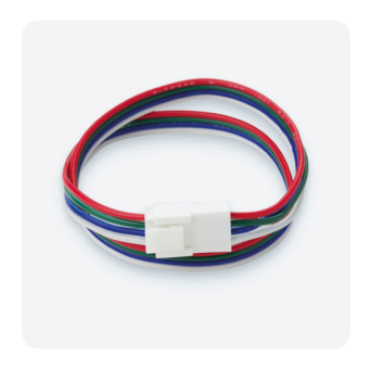
KKCN-11 4 PIN RGB 300mm (11.81") extension lead