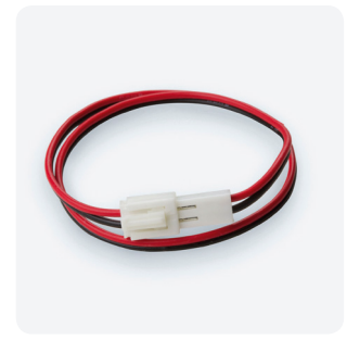
KKCN-06 2 PIN 300mm (11.81") extension lead