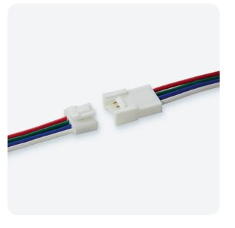
KKCN-07 50mm (1.97") pair KKCN-09 300mm (11.81") pair 4 PIN RGB male + female connector set