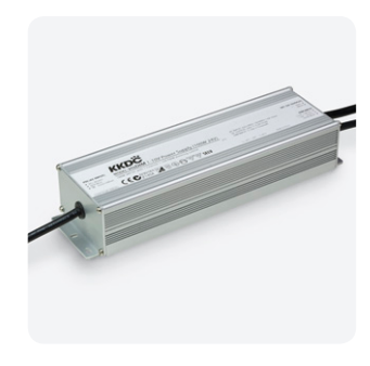
IP67 100W 24V Aluminium housing L248/W73/H48mm (L9.76/W2.87/H1.89in)