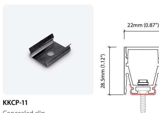
KKCP-11 Concealed clip (Allow 3 per metre/40") S/Steel finish