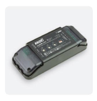
IP20 Black plastic housing L164/W64/H34mm (L6.46/W2.52/H1.34in)