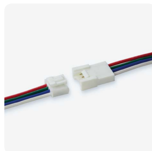
KKCN-07 50mm (1.97") pair