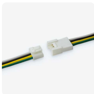
KKCN-18 50mm (1.97") pair